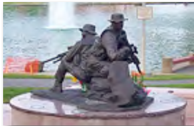
Cupertino Memorial Park

Friday, November 11th at 11:00am Annual Veterans Day Ceremony with military speakers, Air Force Band, Monta Vista Madrigals, and special recognition of Vietnam Veterans with the unveiling of the Vietnam Memorial Boulder